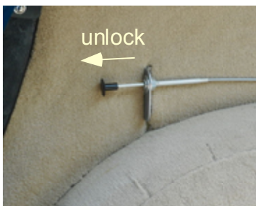
Interior hatch lock knob (right side)