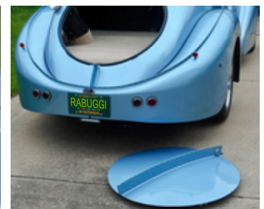
Hatch removed and resting on feet