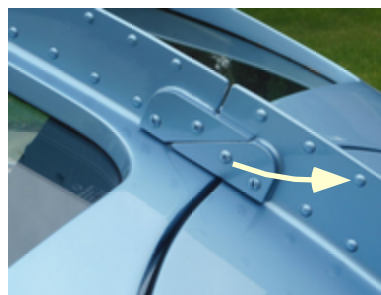
Forward interlocking shoes